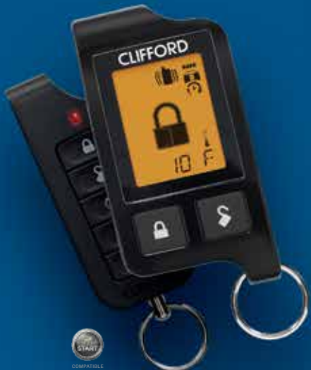
Clifford 4706X LCD 2-Way