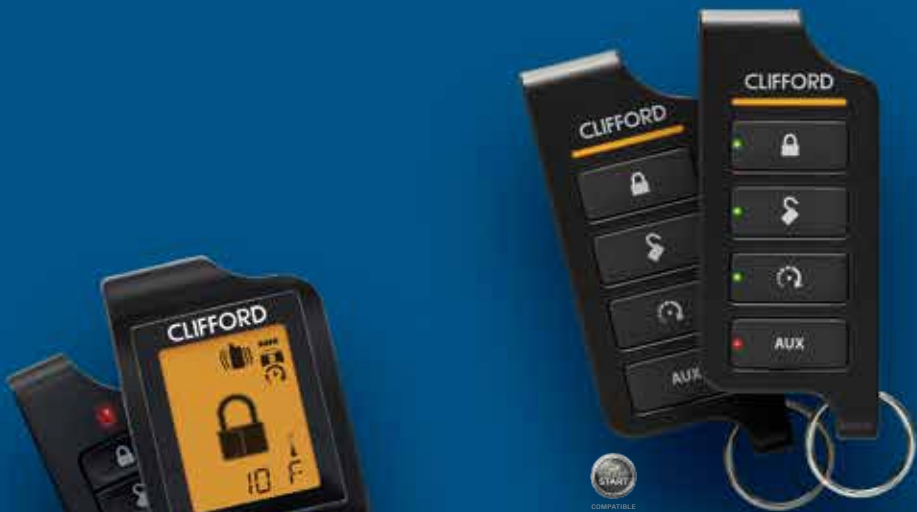
Clifford 4806X LED 2-Way

Clifford remote starts millions of vehicles – including manual shift vehicles – and Clifford systems have the very latest digital OEM integration technologies built in! Most include the Innovations Award-winning XPRESSPORT™, which allows a bypass & interface to make a direct digital connection to the CPU.