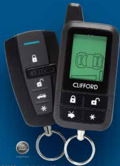
Clifford 3305X 2-Way LCD