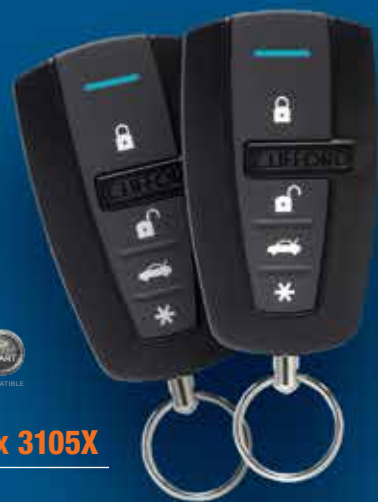
Matrix 3105X 1-Way