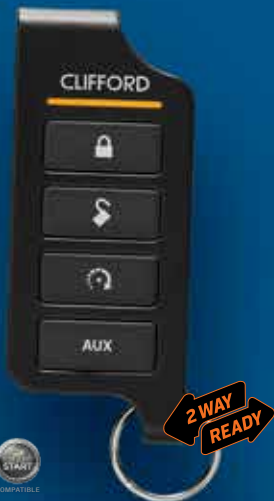
Clifford 4606X 1-Way