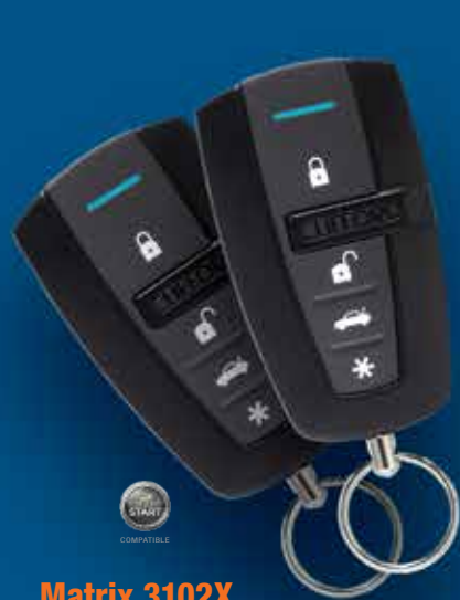
Matrix 3102X 1-Way