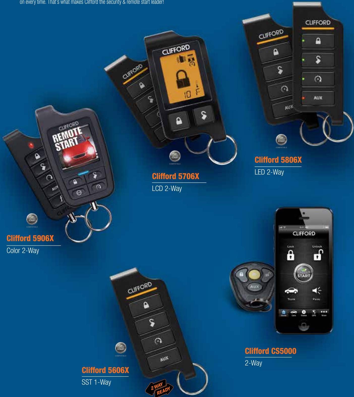
Clifford 5706X LCD 2-Way

Clifford leads the industry in award-winning security & remote start systems with innovative, installer-friendly features designed to boost your margins in the tech bay, including patented Virtual Tach, D2D and XPRESSPORT™, Control Center, Manual Transmission mode, remote mountable shock sensor, onboard remote start relays and flex relays! Plus consumer-friendly features including temp check, remote start reset, and range that your customers can count on every time. That's what makes Clifford the security & remote start leader!