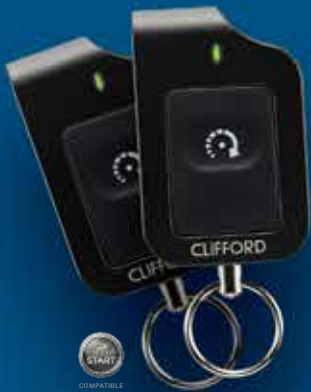
Clifford 4205X One Button 2-Way LED