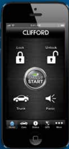
Clifford CS3001 2-Way