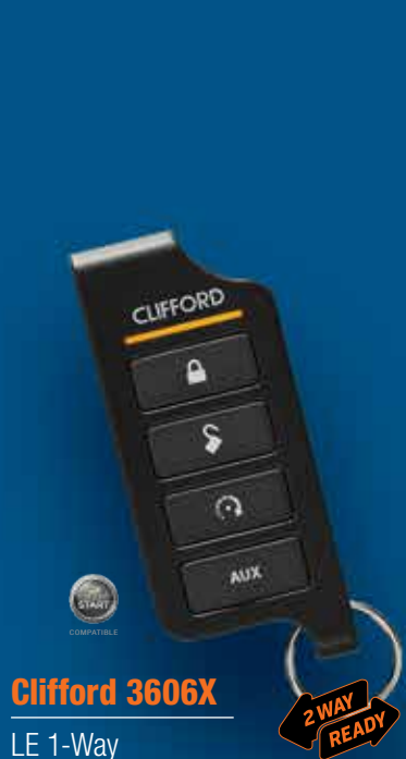
Clifford 3606X LE 1-Way

Clifford Matrix offers more choices for you and your customers, from affordable 1-way to top-of-the-line 2-way systems that provide state-of-the-art protection against thieves and vandals! For customers who don't want to give up their factory key, Clifford also offers innovative OEM Security Upgrades that add the pre-entry protection of the Stinger® DoubleGuard® shock sensor, Revenger® Six-Tone Siren and Failsafe® Starter Kill to virtually any factory keyless entry system.