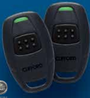
Clifford 4115X One Button 1-Way