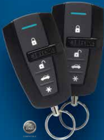
Clifford 4105X Four Button 1-Way